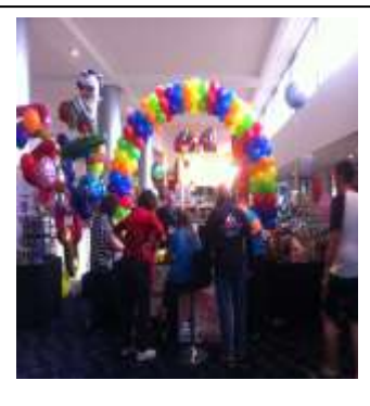
Gold Coast 2013