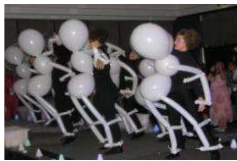
Gold Coast 2007